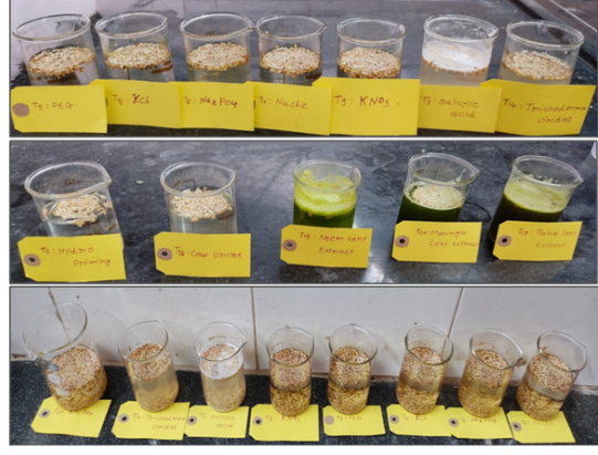
Fig. 1. Different seed priming treatments to sesame seeds.

T<sub>9</sub>: KNO<sub>3</sub> @ 2.0 %, T<sub>10</sub>: KH<sub>2</sub>PO<sub>4</sub> @ 2.0 %, T<sub>11</sub>: Humic acid @ 1.5 %, T12: Vermiwash @ 5 %, T13: Coconut water @ 5 %, T<sub>14</sub>: Trichoderma viride 0.25 g/100 ml, T<sub>15</sub>: Neem leaf extract 5 g/100 ml, T<sub>16</sub>: Cow urine @ 5%, T<sub>17</sub>: Jivamrut @ 5%, T<sub>18</sub>: Bijamurt @ 5%, T<sub>19</sub>: Tulasi leaf extract @ 5% and T<sub>20</sub>: Moringa leaf extract @ 5% (Fig. 1). Seeds were soaked in respective concentration of each of the priming solutions for 8 hours and were dried back to 8 per cent moisture content and after that, the observations on germination (%), shoot length (cm), root length (cm), seedling length (cm), seedling dry weight (mg), seedling vigour Index I and seedling vigour Index II were recorded. The collected data for various seed quality parameters were analyzed using appropriate statistical procedures recommended for completely randomized design by Panse and Sukhatme (1985).